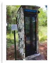
Birchbark phone booth

New installments are ongoing. To obtain flora booklets listing species, usage and sourcing ($28) text Susan at 320-390-2323 or email the MGG: info@minnesotagoosegarden.com