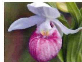
Showy Pink Lady Slipper

Including: Sweet fern, Winterberry, Witch Hazel, Western sunflower, Wild geranium, Musclewood, Wild cucumber, Fireweed, Boneset, Goldthread, Beech, Aster, Cactus, Blackgum, Sassafras, Cottonwood, Lady Slipper, wild onion, wild roses, May apple, Skunk currant, Bergamot, Crabapple, Sage, Spikenard, Twin Flower, Bluebell, Pipestone and copper.