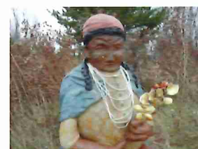
Woman Blown by the Wind