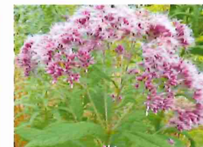
Joe Pye Weed